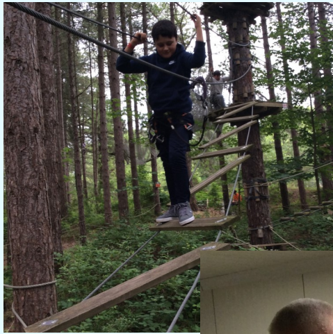
High Ropes and then on to the Boulangerie.